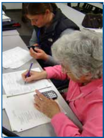
Participants in the Southwest Tech 2008 Annie's Project hone their skills in agricultural accounting.

Annie's Project is organized by the Southwest Tech Farm Business and Production Management instructors and is designed to empower farm women to increase farm business